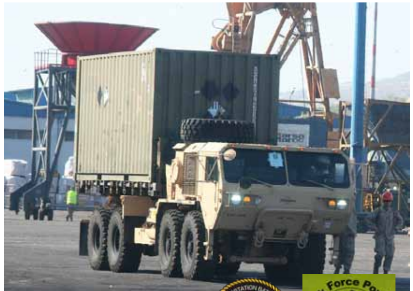
▲ Cargo set to move from Agadir to Tan Tan.

In an agreement with the Agadir port authorities, through Joint Task Force Morocco, JTF-PO (SPOD) established a base of operations, deploying their Joint Operations Center (JOC) on the pier adjacent to the USNS PILILAAU berthing location. From this JOC, JTF-PO (SPOD) was able to seamlessly coordinate all aspects of the operation, ultimately leading to mission success, upon reception of the final piece of exercise cargo at the Cap