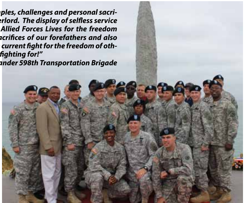
■ The Officers and Department of the Army Civilians of the 598th Transportation Brigade (SDDC) visit Point-Du-Hoc which US Army Rangers assaulted after scaling 100' cliffs to destroy a gun battery.

The second day included visits to Pointe Du Hoc, a gun battery destroyed by U.S. Rangers following an assault up perilous 100 foot high cliffs all while under heavy enemy fire; St. Mere Eglise, the first French village liberated by American forces; the landing sites of U.S. Forces at Utah