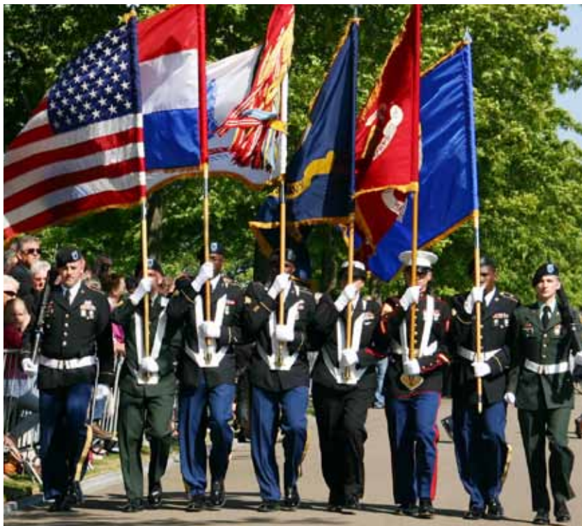
■ The Joint Color Guard from Joint Force Command Brunssum, and the U.S. Embassy in Den Haag, The Netherlands.

The World War II Netherlands American Cemetery and Memorial is the only American military cemetery in the Netherlands. The cemetery's tall