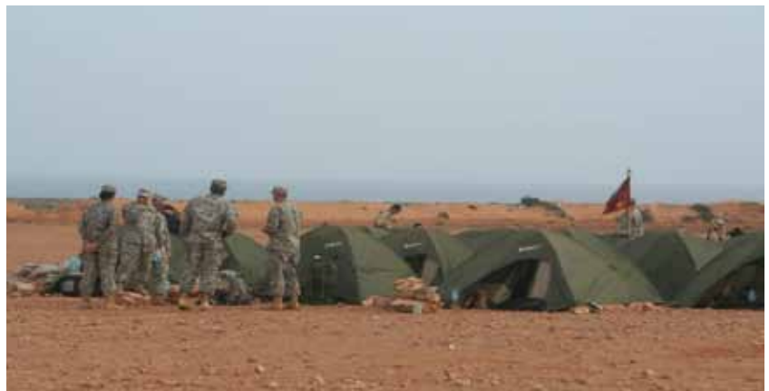
▼ JTF-PO JAT (Joint Assessment Team) and ADVON set up their living area on Tan Tan beach.