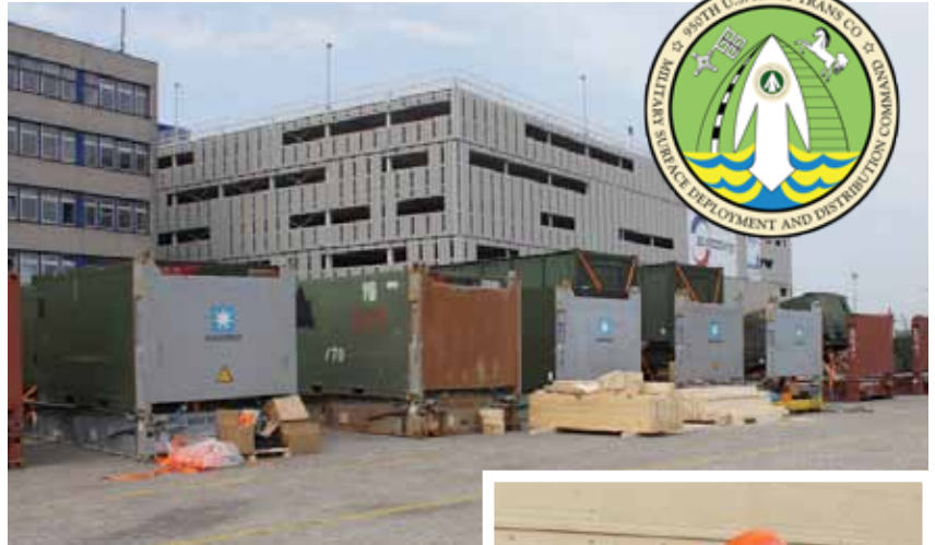
▲ Packing of flatracks to include blocking and bracing of cargo.

The success of this 950th Trans Co is attributed greatly to the experience, institutional knowledge and commitment to excellence of the workforce here. ■