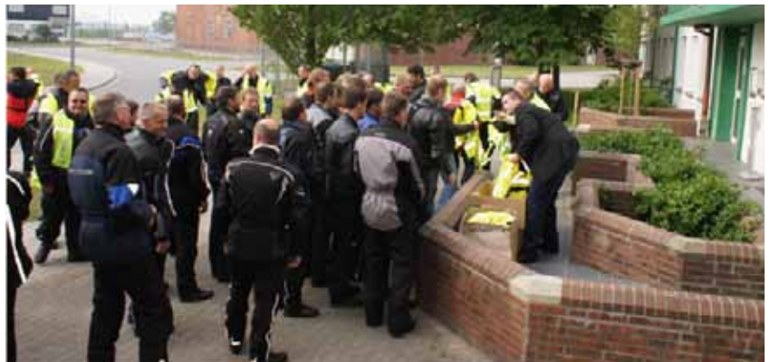
■ All bikers receiving a special safety vest for motorcycle riders before the convoy departs to the airport.

This event organized by German Road Safety Organization (Verkehrswacht Bremerhaven) wel-