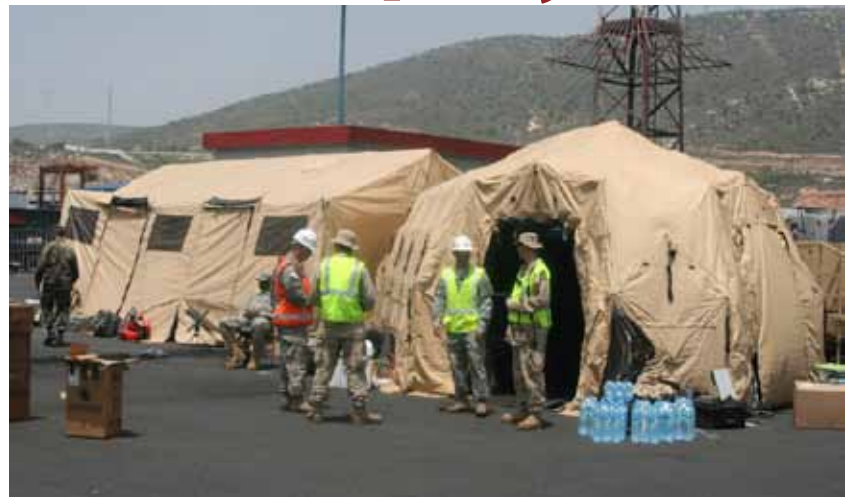
■ JTF-PO JOC at Agadir, Morocco

On the morning of 6 June 2011, cargo started to move from all of the staging areas and was consolidated at one staging location by model at the loading location on the pier. The USNS Pililaa arrived at 1300, the ramp lowered at 1500, and upload operations started at 1600. During the upload process on Day 1, I was responsible for the documentation of all cargo that would be loaded onto D deck. The loading operations on Day one ended at 2100.